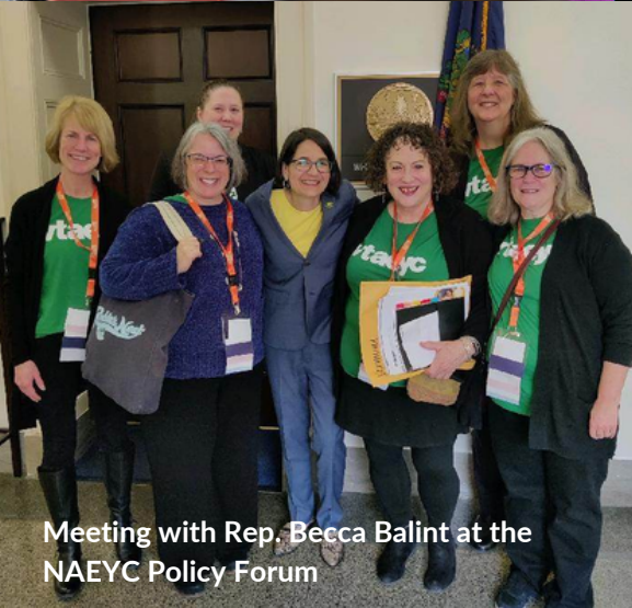
Meeting with Rep. Becca Balint at the NAEYC Policy Forum